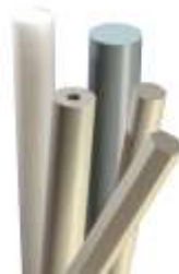
Plates and bars made of PP-H, PP-C