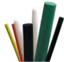
Plates and bars made of PE-HD (PE80, PE100), PE-UHWM