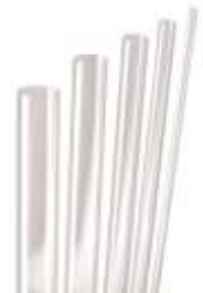
Pipes and bars made of PMMA