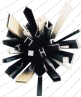
Standard profiles and shaped pipes made of PVC-U, PE-HD, PP