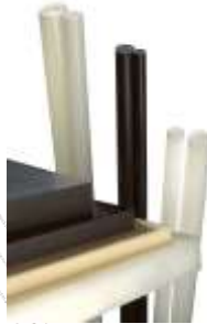
Plates and bars made of POM-C, POM-ESD, POM-AS