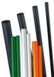
Plates and bars made of PVC-U, PVC-C