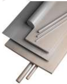
Plates and bars made of PEEK, ECTFE, PCTFE, PTFE, FEP, PFA