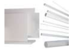
Plates and bars made of PET (PETP)