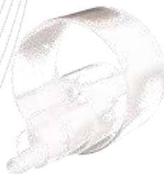
Pipes and bars made of transp. PVC-U