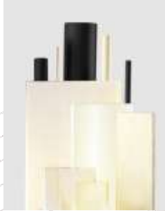
Plates and bars made of PA 6, PA 6.6, PA 6.6 GF30