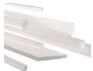
Plates and bars made of PC (Industriequalität)