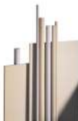
Plates and bars made of ABS